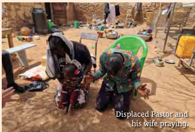
Displaced Pastor and his wife praying.

Gifts towards our current project can be made payable to: GOSHEN INTERNATIONAL MINISTRIES LIMITED