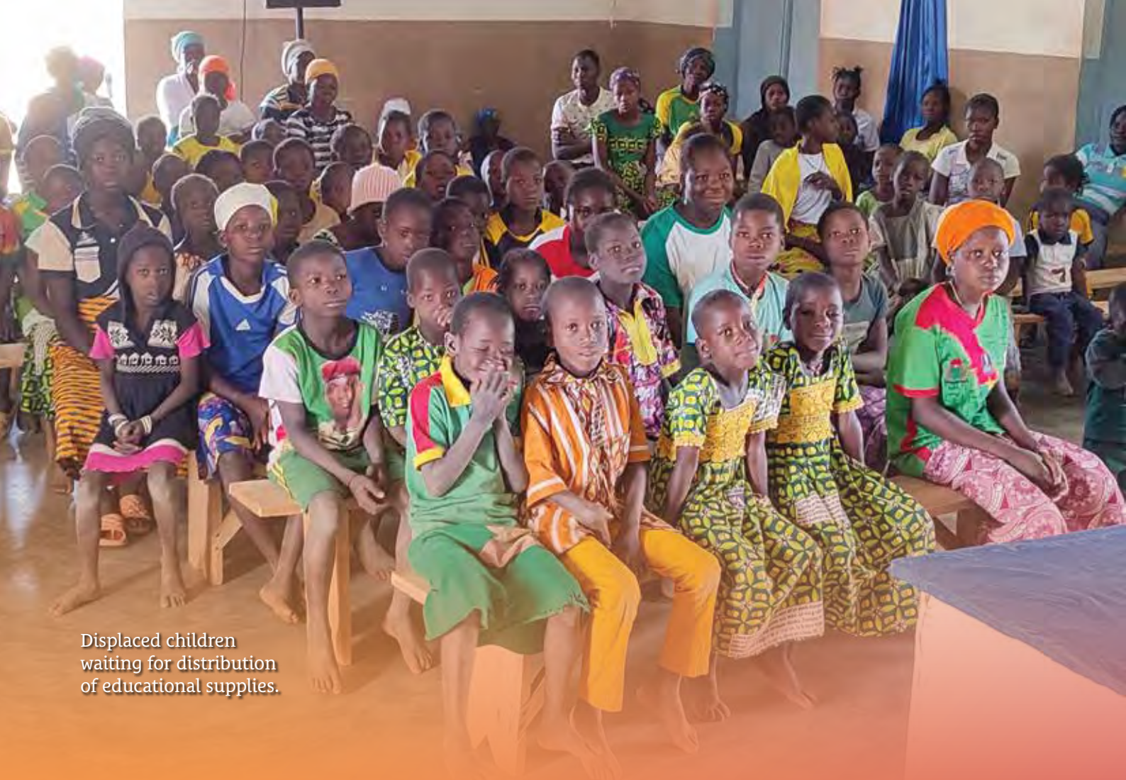
Displaced children waiting for distribution of educational supplies.