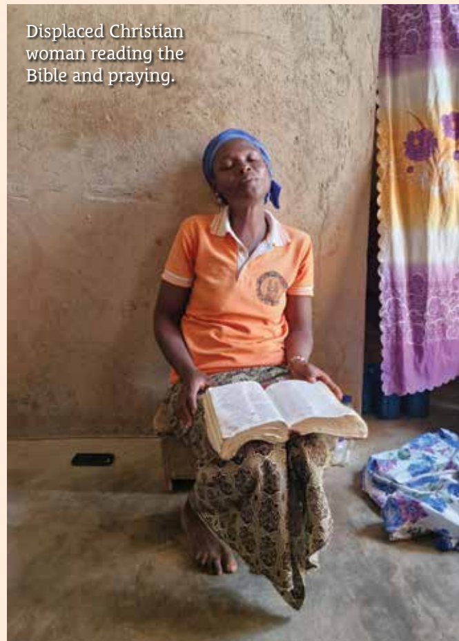
Displaced Christian woman reading the Bible and praying.