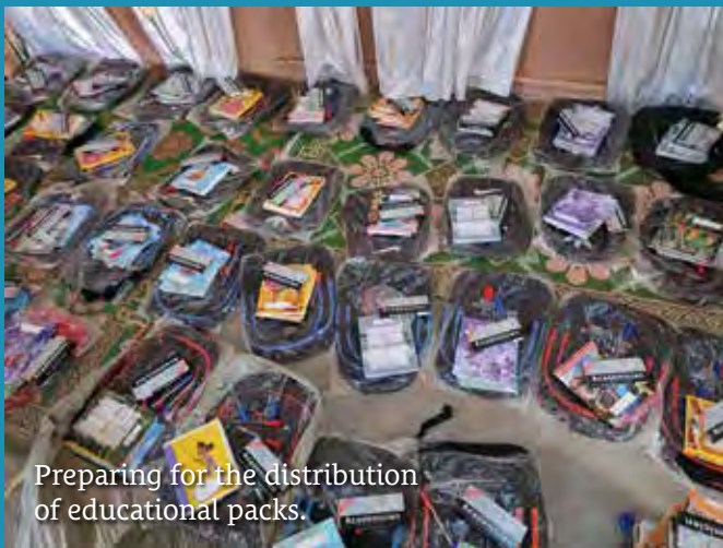
Preparing for the distribution of educational packs.