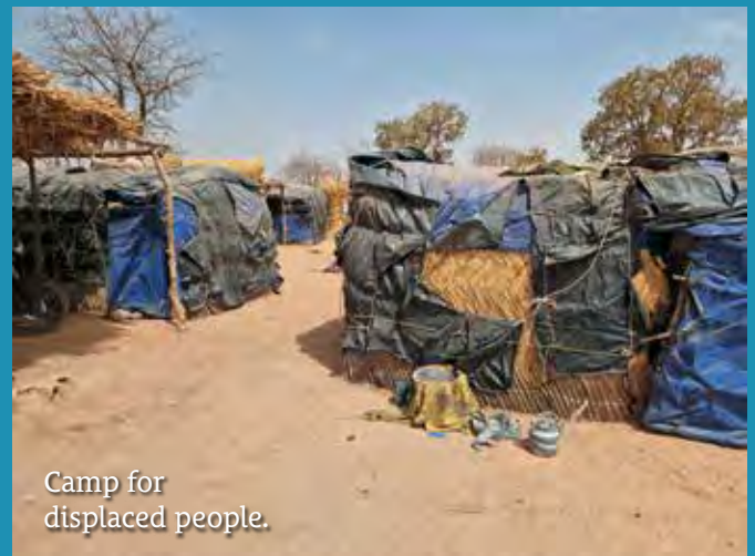
Camp for displaced people.

Gifts towards the Persecuted Church can be made payable to: GOSHEN INTERNATIONAL MINISTRIES LIMITED