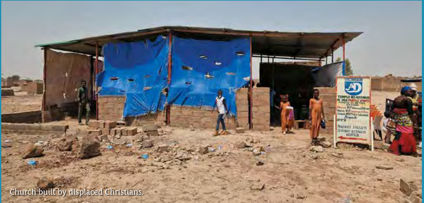
Church built by displaced Christians.